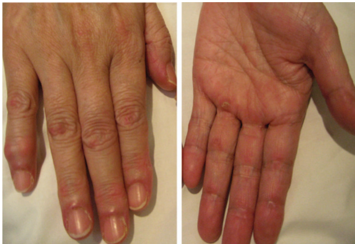
Figure 1. Erythemas on the nail circumference and both dorsal and palm sides around the PIP and MCP joints. MCP = metacarpophalangeal (MCP), PIP = proximal interphalangeal.

Laboratory investigations showed the following results: partial pressure of arterial oxygen (PaO 2 ) 73.5 mm Hg, white blood cell count (WBC) 9400/ \mu L (neutrophils 89.5%, lymphocytes 9.3%), hemoglobin (Hb) 12.1 g/dL, platelet (PLT) 27.0 \times 10^4 / \mu L, C-reactive protein (CRP) 3.4 mg/dL, lactate dehydrogenase (LDH) 231 IU/mL (normal range 124–222), ferritin 319 ng/mL (normal range 6.0–138). The levels of creatinine kinase and aldolase were 79 IU/L and 3.6 IU/L, respectively (= within the normal range). Although the serum Krebs von den lungen (KL)-6 level was 274