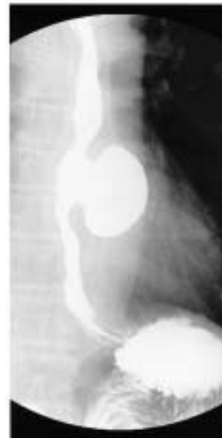
Figure 1. Esophagography revealed a left-sided midesophageal diverticulum of 5 cm in diameter with a broad neck. Achalasia was not present.

under general anesthesia using a double-lumen tube, the patient was turned to his left side and the right lung was completely collapsed.