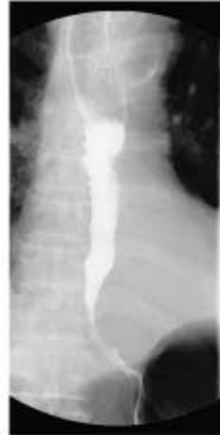
Figure 5. Postoperative esophagography showing a good flow into the stomach without stenosis.

A 10-mm trocar for the insertion of a tracoscope was made in the seventh intercostal space in the anterior axillary line, and a 5-mm trocar was made to allow for the entry of forceps in the eighth intercostal space in the posterior axillary line. A 7-cm mini-thoracotomy was made in the sixth intercostal space between these two trocars. The parietal pleura covering the diverticulum was incised, and the diverticulum was completely exposed and mobilized after exfoliation and pulled by the forceps. Two tapes were passed around the exposed proximal and distal esophagus of the diverticulum. An EndoGIA (United States Surgical Corporation, Norwalk, Connecticut) was inserted through the mini-thoracotomy, placed carefully across the neck of the diverticulum, and fired (Figure 4). Two cartridges