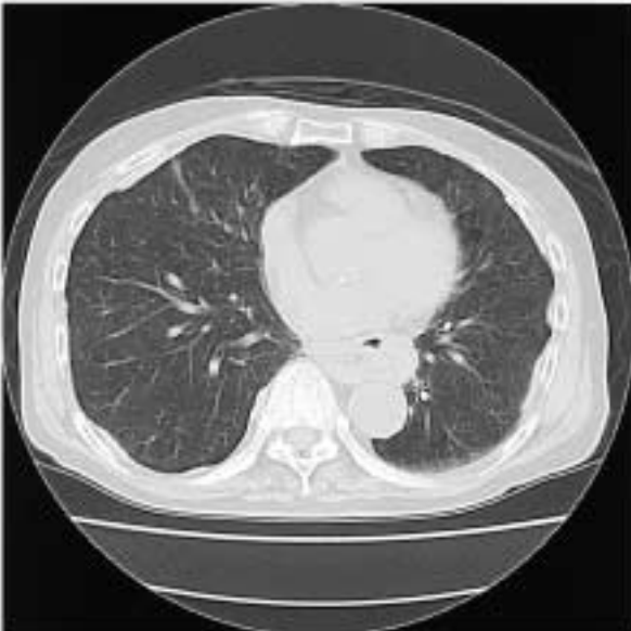
Figure 3. Computed tomography (CT) image showing a diverticulum of the esophagus located between the heart and the aorta.