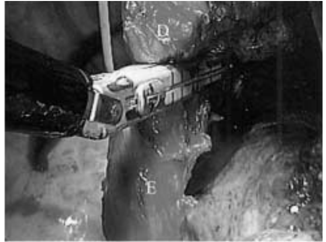
Figure 4. Video-assisted thoracoscopic diverticulectomy was performed using an EndoGIA device. E: esophagus; D: diverticulum.