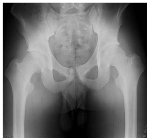
Figure 3 Plain pelvis radiography after 1 year and four months. Still showing irregularity of the pubic symphysis.

exacerbation of inflammatory response, and he was permitted to start jogging 3 months after onset. At 6 months after onset, he was also permitted to return to competitive soccer, but he experienced groin pain every time he played and found it difficult to perform at his former competitive level. MRI was performed at 14 months after onset, and T2WI showed signal hyperintensity in the pubis only (Fig.3); however, blood test results remained normal, with a WBC count of 7200/\mu\text{l} and CRP level of 0.14\text{ mg/dl} . Clinically, the osteomyelitis had resolved, but the patient was in his last year of high school at the time, and since he was unable to play soccer at the level he desired, he decided not to return to competition. The patient is able to perform daily activities and light exercise without any complaints of pain.