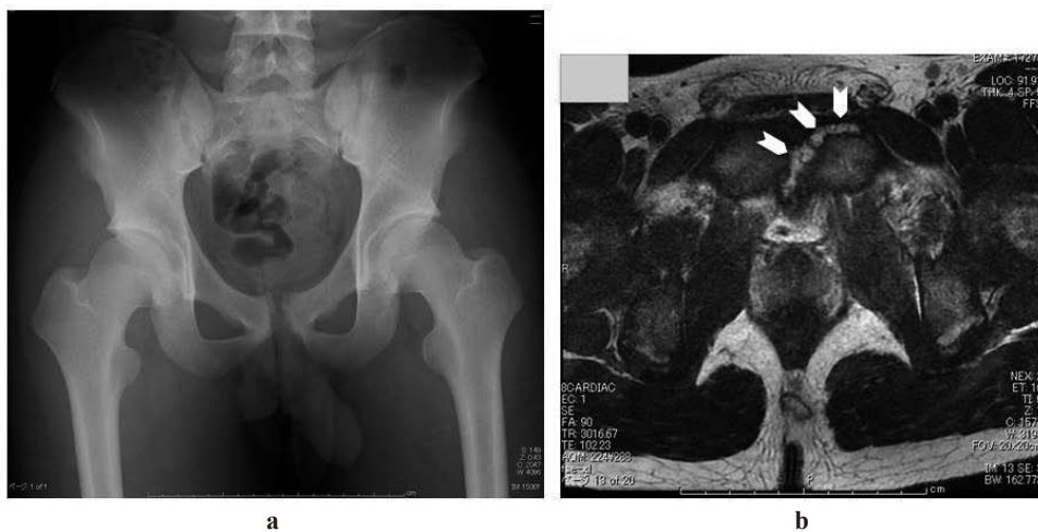
Figure 1 a Plain pelvis radiography. Showing irregularity of the pubic symphysis. b MR image of the pubic symphysis on coronal section. T2WI showed abnormal signal intensities around the pubic symphysis.