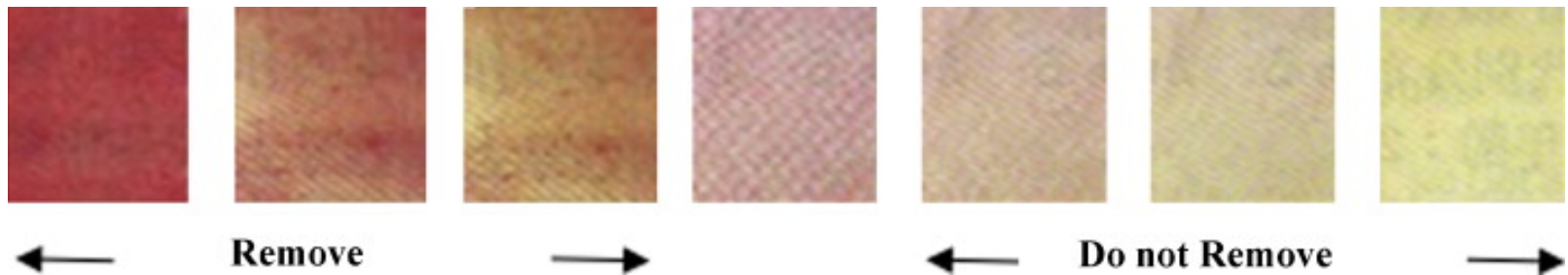
Figure 2. The expert working group agreed by consensus that removal of carious dentin was effectively indicated by the colour after staining using a dye containing 1% acid red propylene glycol.