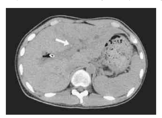
Figure 5. Postoperative computed tomography showed a small residual stone in the left intrahepatic duct (white arrow) and a percutaneous transhepatic cholangiodrainage tube in the right intrahepatic duct.