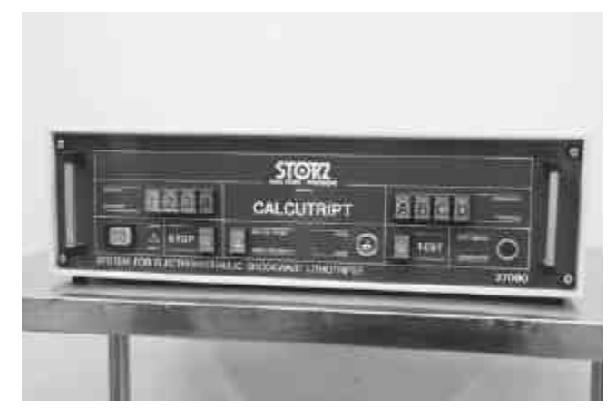
Figure 3. An electrohydraulic shock wave generator (Storz Calcutript 27080) for EHL.

a flexible choledochoscope (CHF Type T20; Olympus, Tokyo, Japan) under general anesthesia. This method was also somewhat effective; however, due to the amount of packed stones, there was insufficient working space. We then performed cholangioscopy-directed EHL. The generator used for the procedure was a Storz Calcutript 27080 (Karl Storz Gmbh & Co. Kg, Tuttlingen, Germany) (Figure 3). The stones were easily fragmented by bringing the EHL close to the surface of each stone and carefully generating shock waves. The stones were then washed away with saline (Figure 4). We applied this method to each hepatic lobe at 1-week intervals. A total of 500 shocks were used to fragment the stones for two days. Postoperative radiological investigation showed a small, residual stone in the right lobe (Figure 5). Although the patient suffered from iterative cholangitis 12 months after the procedure, there was no regrowth of the intrahepatic duct stone. He is currently doing well and has not had any recurring episodes of bile duct stones.