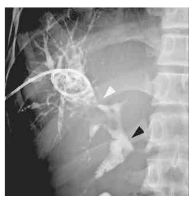
Figure 2. Percutaneous transhepatic cholangiography showed multiple stones in the right lobe proximal to stenosis of the right bile duct (white arrowhead). A black arrowhead indicates the hepaticojejunostomy.

a flexible choledochoscope (CHF Type T20; Olympus, Tokyo, Japan) under general anesthesia. This method was also somewhat effective; however, due to the amount of packed stones, there was insufficient working space. We then performed cholangioscopy-directed EHL. The generator used for the procedure was a Storz Calcutript 27080 (Karl Storz Gmbh & Co. Kg, Tuttlingen, Germany) (Figure 3). The stones were easily fragmented by bringing the EHL close to the surface of each stone and carefully generating shock waves. The stones were then washed away with saline (Figure 4). We applied this method to each hepatic lobe at 1-week intervals. A total of 500 shocks were used to fragment the stones for two days. Postoperative radiological investigation showed a small, residual stone in the right lobe (Figure 5). Although the patient suffered from iterative cholangitis 12 months after the procedure, there was no regrowth of the intrahepatic duct stone. He is currently doing well and has not had any recurring episodes of bile duct stones.