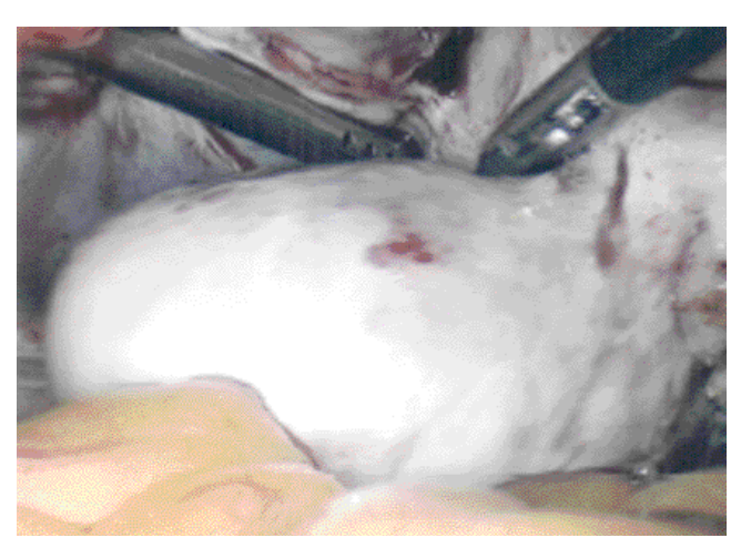
Figure 2. Normal appearance of the Rright ovary during the second operation

formed a cystectomy of the right ovarian dermoid cyst. After the 2-stage operation, ultrasound showed normal follicle development in the right ovary.