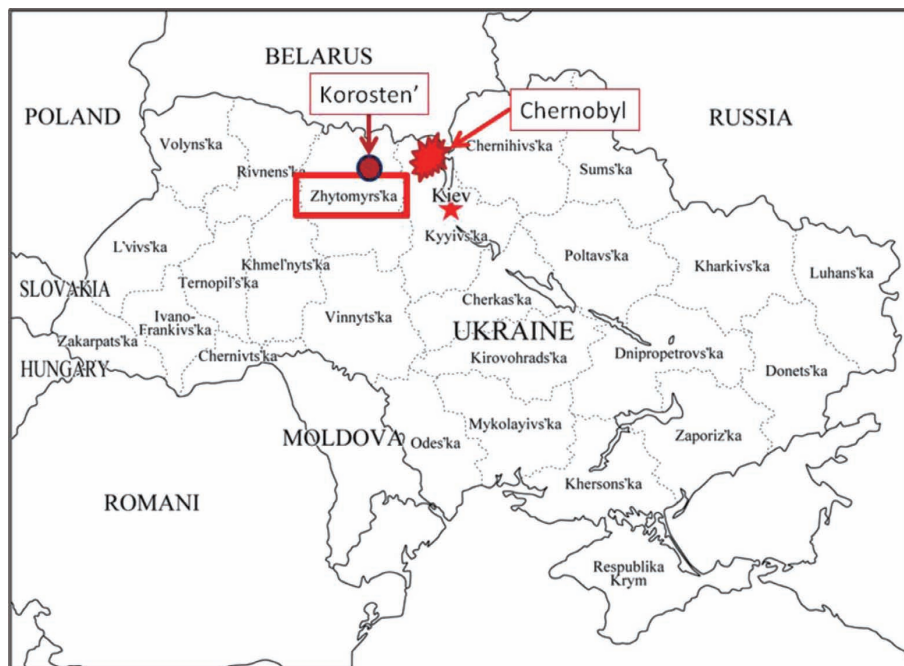
Fig. 1. Location of the Zhitomir region, Ukraine.

The median age of participants in each year was 16–39 years, and women accounted for 60% to 70% of the total. The sex ratio and mean weights of the participants were