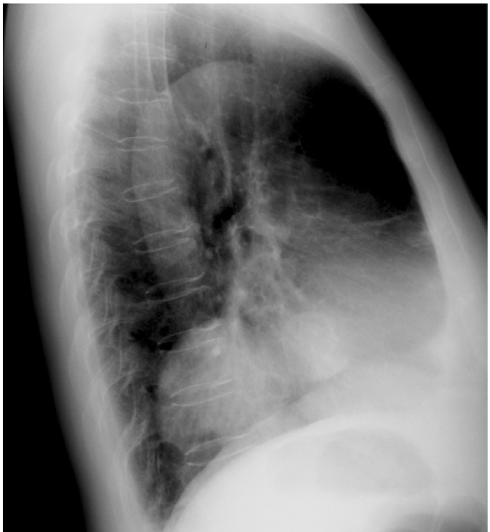
Figs. 1 and 2: PA and lateral chest radiographs showing two round opacities in the right lower lung field, simulating mediastinal tumors.