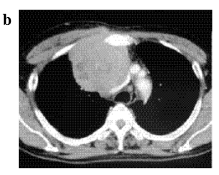
Figure 1. a) Chest X-ray on admission, showing a huge tumor in the right upper mediastinum. b) CT image of the chest on admission, showing a huge tumor with low-density area, invading the anterior chest wall and compressing the superior vena cava.