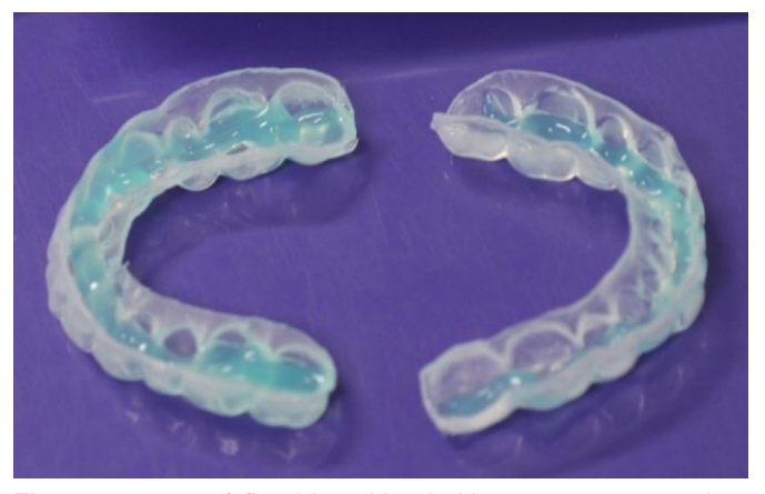
Figure 1 0.145% fluoride gel loaded in a custom tray, to be worn by the study participants at bedtime.

In 2017, regulations allowed the use of the highest concentration of 0.15% fluoride in Japan. Although it is about 1/10 of the concentration used in other countries, we aimed to obtain the same effect by extending the action time of the fluoride. First, we investigated the incidence of dental caries in head and neck cancer patients who had not received fluoride. The mean of new dental caries 1 year after RT in 31 patients with head and neck cancer undergoing RT was 2.68, while no newly developed dental caries was found in 25 patients with oral cancer who underwent surgery but not RT 1 year after the surgery. Next, as a preliminary study, 13 patients with head and neck cancer undergoing RT received topical application of 0.145% fluoride gel in custom tray during sleep every day for 1 year (figure 1), and as a result no newly developed dental carious lesion was found in all 13 patients. These results show that application of low concentration fluoride gel in custom trays during sleep every day is promising preventive method for radiationrelated dental caries. Therefore, we conduct a randomised controlled phase III study (FluCar study) to evaluate the efficacy of low concentration fluoride gel using custom