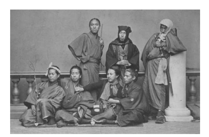
Figure 4. Wilhelm Burger, Nagasaki. Doctoren aus dem Hospital, 1870, wet collodion cabinet card. Österreichische Nationalbibliothek, Bildarchiv, Pk 4487, 74.