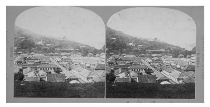
Figure 3. Wilhelm Burger, Ansichten von Nagasaki, 1870, wet collodion albumen stereograph. Nagasaki University Library Collection.

Although there is some discrepancy as to the elapsed period of time, Burger was well known for his advocacy of this experimental dry plate technique. <sup>16</sup> Working with a Voigtländer-Petzval portrait lens, the required exposure time of seven minutes underscores the disadvantage of such early dry plate methods. In most cases, Burger made use of the conventional and generally more reliable wet-collodion process. His shift to the dry plate may suggest an experimental impetus but was more likely prompted by a shortage of materials.