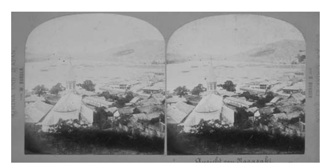
Figure 2. Wilhelm Burger, Ansichten von Nagasaki, 1870, wet collodion albumen stereograph. Nagasaki University Library Collection.