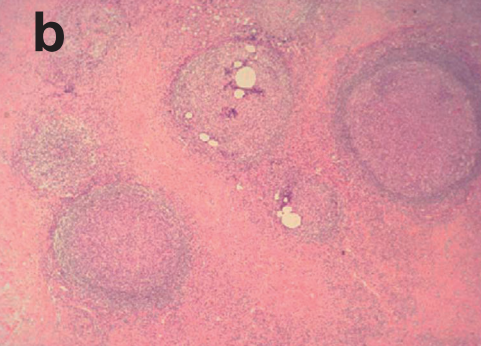
Figure 1. a) Abdominal CT imaging of the subcutaneous mass in the left hip (arrowheads). b) Light microscopy of a sample from skin biopsy (Hematoxylin and Eosin staining, ×100). Eosinophil infiltration, lymphoid follicles, fibrosis, and vascular proliferation were noted.

nodes was noted. The white blood cell count (WBC) was 8,100/μL, with 30.5% eosinophils. Total protein and albumin were 6.9 g/dL and 4.2 g/dL, respectively. Serum creatinine and blood urea nitrogen (BUN) were in the normal range. Creatinine clearance was 115.7 mL/min. Urinalysis indicated a urinary protein level of 2.1 g/day. Urinary occult blood was 3+ in a qualitative test, and 30-50 red blood cells (RBCs) were present per visual field in the sediment. Dysmorphic RBCs were present in the sediment of urine. No urinary cast was noted and urinary β2-microglobulin was in the normal range (103 μg/L). Urinary N-acetyl-β-Dglucosamidase (NAG) was elevated to 14.0 IU/L among renal tubular disorder markers. In seroimmunological tests, the serum IgE level increased to 8,450 mg/dL. No evidence of collagen disease was found in the laboratory examinations. Computed tomography (CT) showed no marked changes in the kidneys and a localized mass with unclear boundaries in the left hip (Fig. 1a).