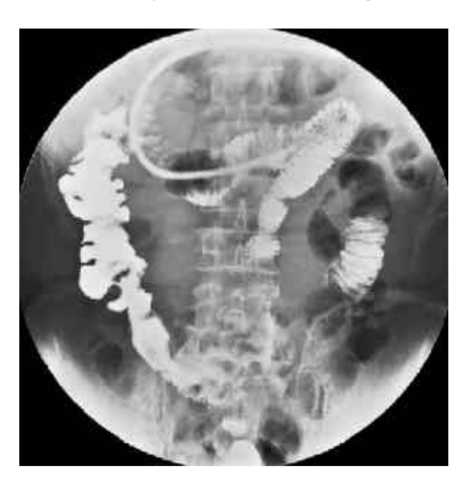
Figure 2. Small bowel X-ray confirmed a large cavitary lesion forming an ileo-jejunal fistula.

performed. The specimen exhibited diffuse proliferation of atypical medium to large lymphoid cells that were positive for TIA-1, CD8 and CD3, but negative for CD20, CD4 and CD30. Enteropathy-type intestinal T-cell lymphoma was considered. Small bowel X-ray (Figure 2) showed a large cavitary lesion forming an ileojejunal fistula. Partial ileectomy, partial jejunectomy and partial sigmoidectomy were performed on June 15, 2004. The tumor measured 60 \times 70 mm and penetrated the jejunum, adhering to the mesocolon of the Sigmoid colon. The tumor comprised diffuse