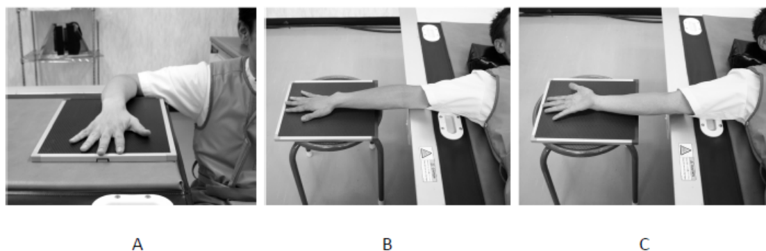
Figure 1. Limb position during imaging. A: Standard imaging group (sitting - 90° shoulder abduction - 90° elbow flexion). B: Supine-palm contact group (supine - 90° shoulder abduction - elbow extension - palm of hand in contact with cassette). C: Supine-dorsum contact group (supine - 90° shoulder abduction - elbow extension - dorsum of hand in contact with cassette).