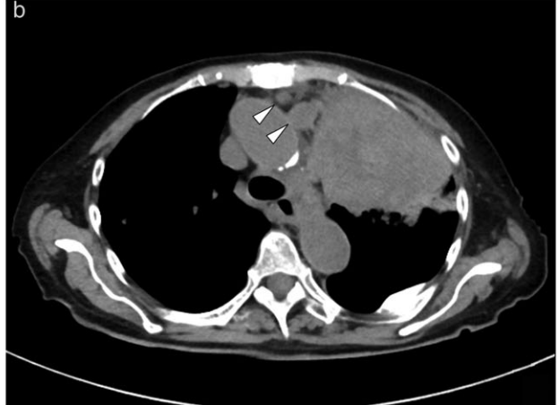
Figure 2 Computed tomography images of an 80-year-old woman with adenocarcinoma with ALK gene rearrangement. ( a ) Lung window image showing a large solid mass in the central area of the left upper lobe. Multiple scattered nodules suggest lung metastasis (arrows). ( b ) Mediastinal window image showing lymphadenopathy (arrowheads).