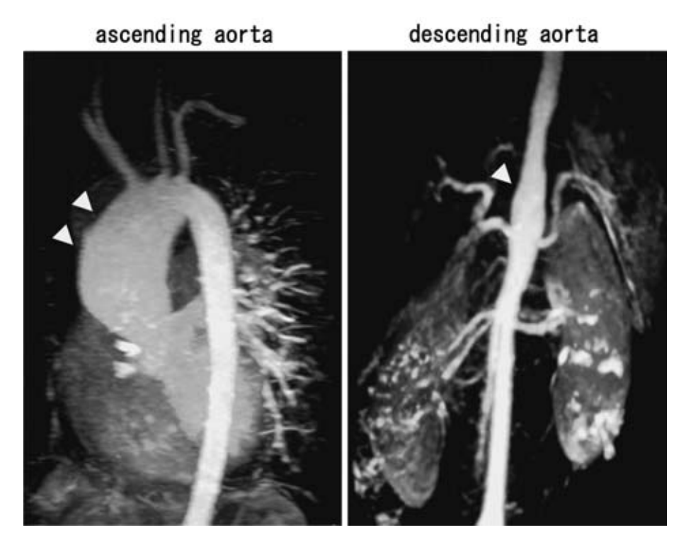
Figure 2. Dilatation of both the ascending aorta and the descending aorta determined by MRA. The arrowhead indicates the portion.

well as ESR remained continuously elevated, so the patient was admitted again to our hospital in July 2004. Although she suffered from a fever during the first visit, elevated temperature was not remarkable during the treatment with prednisolone and methotrexate, thus the relapse of TA was judged by the increment of bruit as well as that of inflammatory reactions.