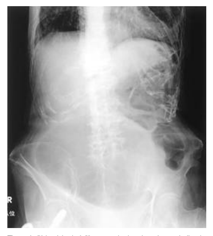
Figure 1. Plain abdominal X-ray examination showed a markedly airdistended bowel segment in the right lower abdomen associated with laterally-shifted dilated small bowel.

Based on these findings, we gave a diagnosis of cecal volvulus associated with intestinal strangulation. An emergency laparotomy was thus performed. During the laparotomy, the ileocecal region, which was unfixed at the retroperitoneum, was found to be twisted clockwise by 360 °around the mesentery with the terminal ileum,