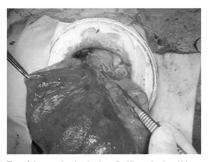
Figure 3. Intraoperative view showing unfixed ileocecal region which was twisted clockwise by 360 °around the mesentery with the terminal ileum. The colonic wall demonstrated vascular compromise and patchy gangrene.

confirming the diagnosis of cecal volvulus (Figure 3). Since the colonic wall demonstrated vascular compromise and patchy gangrene, we performed an ileocecal resection without detorsion of the cecal volvulus and reperfusion. The surgical procedures were uneventful. Histopathological findings of the resected specimen revealed acute ischemic changes including submucosal edema, vascular congestion, and hemorrhage with partial necrosis throughout the bowel wall (Figure 4). There was no neoplastic lesion in the resected specimens. The patient developed no postoperative complications except for wound infection and was discharged from our hospital without further incidence. She remains free of recurrence 24 months after surgery.