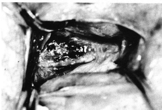
Fig. 3. Two cm longitudinal, and full-thickness tear was located on the lower esophagus approximately three cm above the diaphragm.