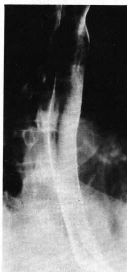
Fig. 4. Esophagogram after operation.