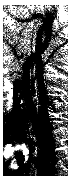
Fig.4. Left cervical carotid angiogram showing the complete obliteration of the false lumen and the patency of the internal carotid artery nine months after the procedure.

were confirmed on the follow-up carotid angiogram nine months after stenting (Fig. 4).