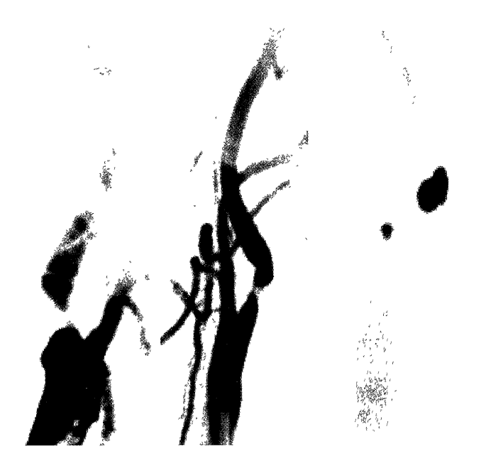
Fig.1. Right cervical carotid angiogram showing severe stenosis of the internal carotid artery (left). Left cervical carotid angiogram showing severe stenosis of the internal carotid artery (middle). Three-dimentional CT(maximum intensity project image) showing calcification at the stenotic lesion of the left internal carotid artery (right).