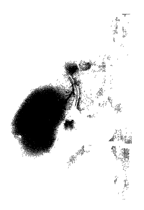
Figure 2. Endoscopic retrograde cholangiogram showed a filling defect measuring 20\ x30\ mm in diameter the extrahepatic bile duct.

bile duct at the junction of the cystic and common hepatic duct. There was no evidence of involvement of the perineural lymph node or direct invasion of the tumor into adjacent vascular system. No abnormality was seen in the liver or pancreas on intraoperative ultrasonography. The common hepatic bile duct was opened, and a 20 x 30 mm papillary polyp was removed by a wedge resection. Stones or other tumor in the gall-bladder or biliary tract was not seen on the intraoperative ultrasonography and choledochoscopy. The repair of the biliary duct was done by interrupted sutures. Histopathologic diagnosis of surgical specimen was papillary adenoma with no evidence of malignancy (Fig. 3a,b).