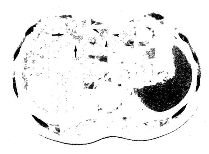
Figure 1. Plain CT showed low density masses in the liver. arrowheads: S3, arrows: S4

Histological examination revealed an invasive ductal carcinoma, while a hormonal evaluation of tumor tissues showed that estrogen and progesterone receptors were both positive. An excision of the chest wall with linac irradiation, a right mastectomy, and repeated skin excisions caused by local recurrences and metastases from the left breast cancer were consecutively performed during the period of March 1993 and July 1994. On September 1994, computed tomography (CT) initially showed multiple liver metastases, measuring 3.5 cm (S4) and 2 cm (S3) in diameter (Fig.1), with an elevation of serum CA 15-3 levels (240 U/ml, normal range:<27 U/ml) which is an indicator of distant metastases from breast cancer. Enhanced CT showed ring-enhancement and partly iso to low density in the late phase (Fig.2). Owing to the treatment with tamoxifen, 5-fluorouracil (5-FU) and cyclophosphamide, the size of liver tumors have not changed and serum levels of CA 15-3 ranged from 26 to 84 U/ml for one year and five months. CT examination showed that