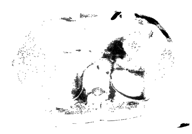
Figure 4. Enhanced CT revealed strong lipiodol-deposits in the liver tumor after the first TAE.

metastatic liver tumor of the S4 segment had gradually increased in size, measuring about 4.5 cm in diameter on December 1995. Angiography revealed diffuse hypervascularity (Fig.3). The first transcatheter arterial embolization (TAE) using 10 mg of mitomycin C, 30 mg of epirubicin hydrochloride with lipiodol emulsion and gelatin sponge particles was performed on February, 1996 (Fig.4). The S4 lesion obviously decreased in size; however, complete remission was not revealed by CT examination on May 1996. We evaluated that TAE was effective and that another TAE was necessitated for this patient. The second TAE was performed on June 1996. Finally, eight courses of TAE with the same regimen and the same doses was completed by February 2000. She also received a systemic treatment with aromatase inhibitor, 5-FU, and medroxyprogesteron which had begun on October 1998. The size of liver tumors showed a partial