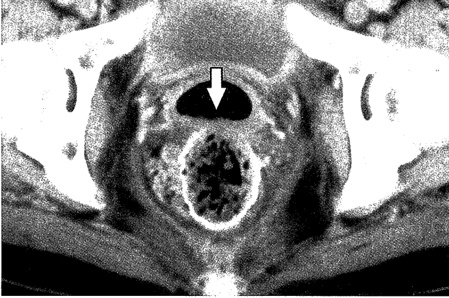
Figure 1 Pelvic CT showed a deformed, thin posterior wall of the vagina at exactly the same level of the stapled anastomosis portion, which was considered a rectovaginal fistula (arrow). Collection of air in the vagina was observed. Anastomosis included staples.