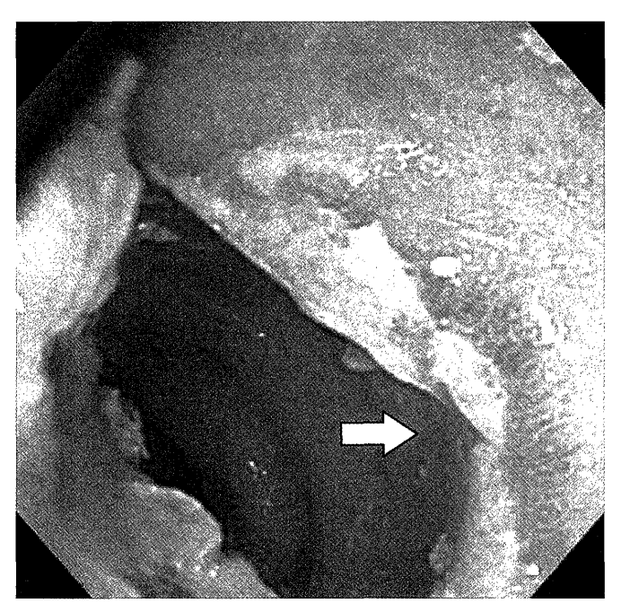
Figure 2 On the 42nd postoperative day, closure of the rectovaginal fistula was confirmed by colonoscopy. Arrow indicates the scar of the rectovaginal fistula within the stapled anastomosis.