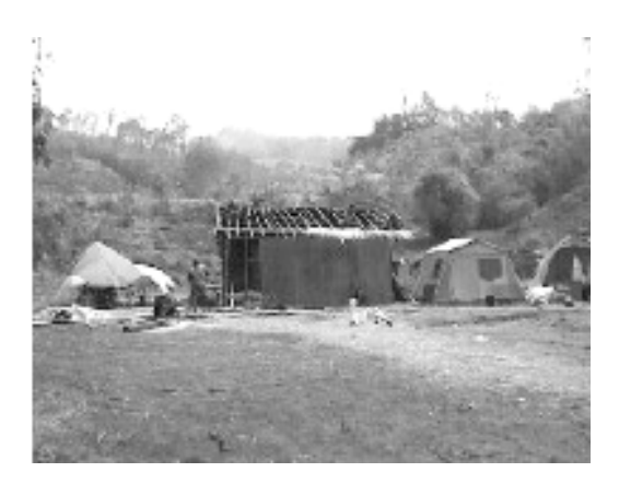
Picture 3.Elementary school (under contraction); Now this construction is used as a kindergarten (private communication from Yoshida M.).