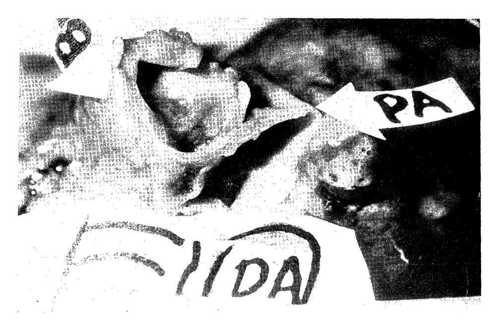
Fig 1. Resected specimen which showed segmental resection of both the bronchus and pulmonary artery.

However, we were encountered in 2 cases of operative death. One of these 2 cases died of severe dyspnea on the 12th postoperative day. The other died in 24 hours