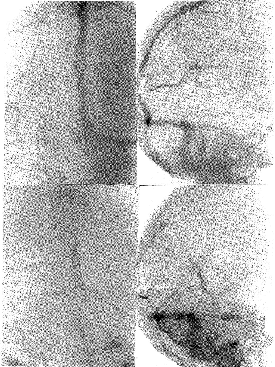
Fig. 3 Case 5, after surgery. Upper : Venous phase by right carotid angiography showing non-filling of the thalamostriate and internal cerebral veins. Lower : Venous phase by vertebral angiography showing disappearance of the tumor blush.