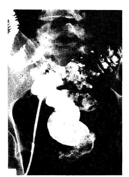
Fig. 2. Communication of sigmoid colon to the ileum by barium enema, indicating multiple diverticular diseases of the colon.