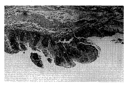
Fig. 1. Type I mucosal cancer spread along bronchial wall.

Mucosal spread (type I) is a type of sustained cancer extension along the mucosa. In this type, its spread showed patterns of either spreading with defined margin or replacing the intact mucosa with tumor. (Fig. 1)