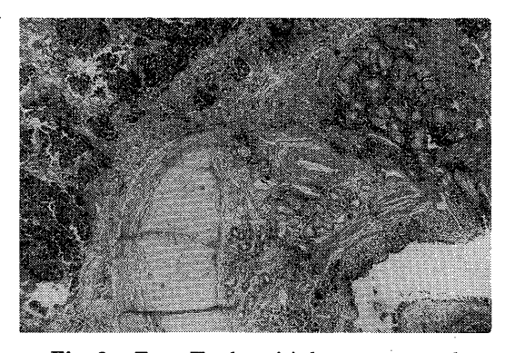
Fig. 3. Type II adventitial cancer spread

Adventitial spread (type III) is a type of cancer extension along the outer layer of the bronchus, not infrequently accompanied by skip lesions. (Fig. 3)