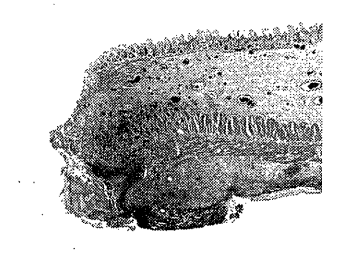
Fig 3. Histologic finding, showing punched outlike perforation.