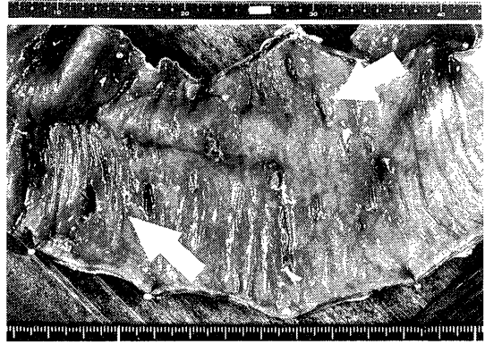
Fig 2. Schematic presentation of the perforating sites and surgical specimen, showing punched-out perforations.

present in the further proximal ileum on palpation so that a 80cm long ileum was resected. The cut edges were free of ulceration, showing redness and edema on gross apperance.