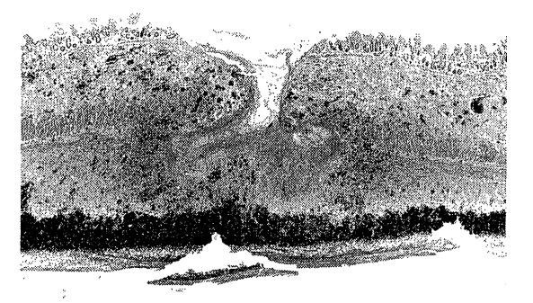
Fig 4. Histologic finding showing no presence of a finding of microangitis.