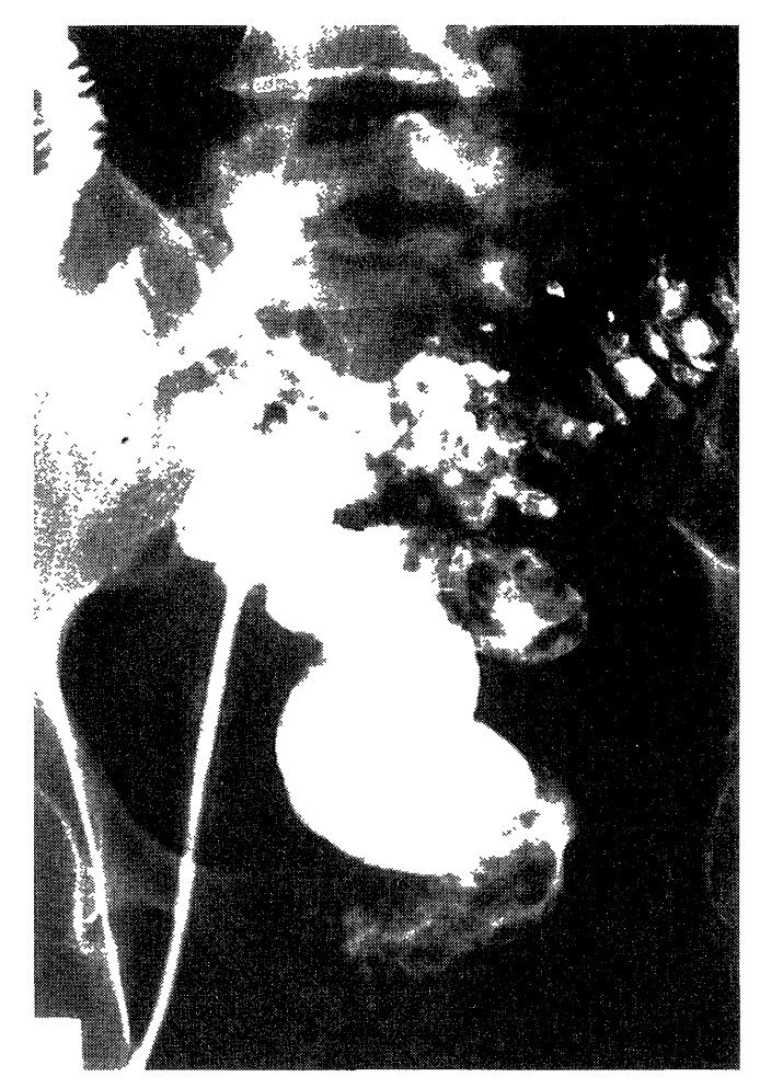
Fig. 1. Barium enema revealed multiple diverticulosis of the sigmoid colon.

Each patient complained of palpation of the tumor mass with stimulating syndrome of the urinary bladder and obstruction syndrome of the ileum. The time duration from onset to operation varied with variety and ranged from 2 weeks to 1 year.