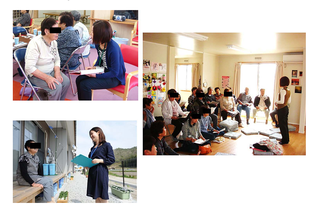
Fig. 3. Individual consultation on radiation health effects by a public health nurse in Kawauchi Village [4].

to provide individual consultation on radiation exposure and health [6]. In April 2013, a comprehensive agreement was concluded between Nagasaki University and the Kawauchi Village Office, and a satellite office of Nagasaki University was established in the village. From this