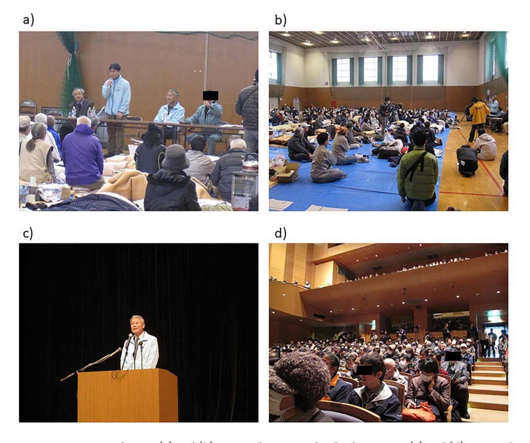
Fig. 1. Crisis communication at: Iwaki City (a) and (b) 20 March 2011; and Fuksuhima City: (c) and (d) 21 March 2011 [4].

thing is to prepare explanations on the basis of realistically conceivable scenarios and arrange answers to the questions that residents might have regarding such scenarios. In the crisis communication following the FDNPS accident, the questions posed by the residents were much the same all over Fukushima Prefecture [4]. We noticed that it is particularly important for health care workers to prepare good explanations and answers to possible questions in conceivable scenarios on the basis of the experience of Fukushima.