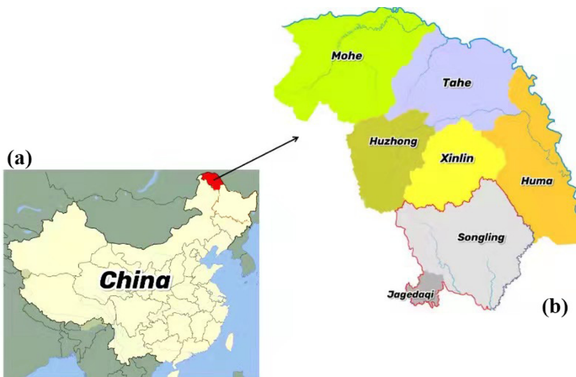
Figure 1. Location of Daxinganling region in China: (a) overall location of Daxinganling in China (Wikipedia); (b) detailed location of Daxinganling (image source from China map).

The Daxinganling region is located in the northwestern part of Heilongjiang Province, the northernmost border region of China (Figure 1). This unique geographical location leads to a monopoly and scarcity of tourism resources and landscapes. Daxinganling not only contains the densest high-quality cold-temperate forestry ecological landscape in China, but also very wide-ranging topography and landforms as well as biodiversity. According to data released by the Daxinganling District Office of Heilongjiang Province Government and the government website of the State Forestry and Grassland Administration of China, as of 2020, there were more than 50 natural tourism resources in the Daxinganling region.