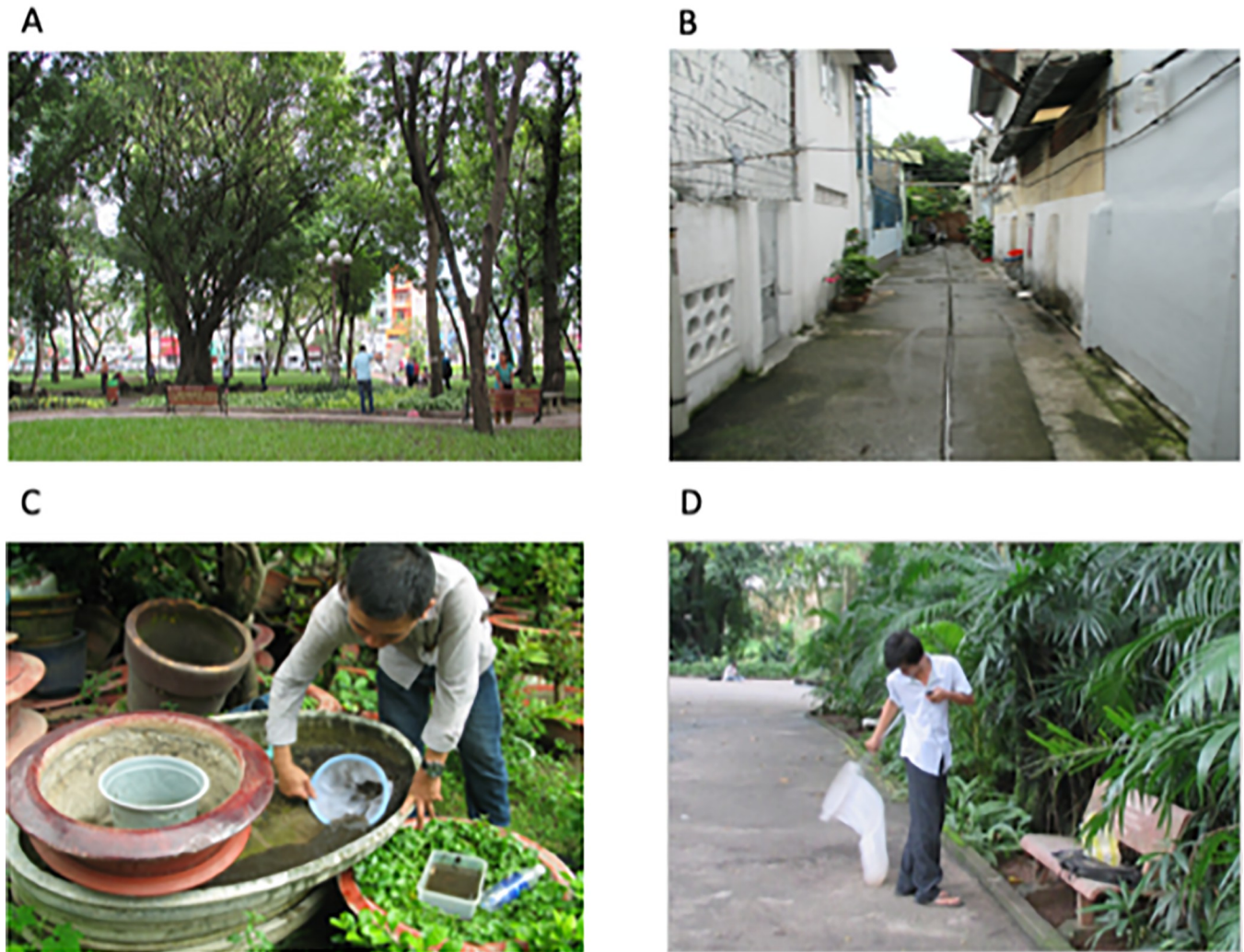
Fig 2. Photographs taken in the study area. (A) park, (B) residential area, (C) sampling larvae from planters in a courtyard, and (D) sampling adults in one of the parks.

https://doi.org/10.1371/journal.pntd.0010119.g002