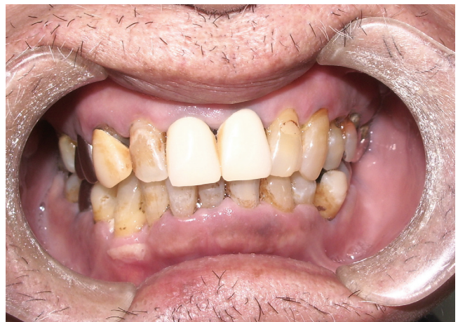
Figure 4 Regression of gingival enlargement on day 61. Note the gingival epithelium healing around the mandibular right canine.