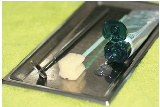
Figure 3 A sponge sweeper (center) and moisturizing gel (right)

tained within the normal range. Consolidation chemotherapy with Ara-C and mitoxantrone was commenced 24 days after completion of induction chemotherapy. After the second cycle of consolidation with Ara-C and aclarubicin, the patient underwent six courses of maintenance chemotherapy as described by Miyawaki et al 6 . On day 61, we performed a periodontal examination and found several periodontal pockets exceeding 4 mm in depth. Routine periodontal treatment has been conducted since then. The patient remains in remission and is free from sore mucous lesions and gingival enlargement to date (Fig 4).