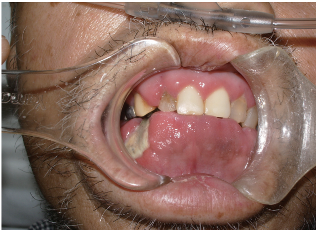
Figure 1 Gingival hyperplasia on day 4 of chemotherapy. The mandibular teeth were covered by the enlarged gingivae. White degenerated epithelium was located around the mandibular canine on the right side.