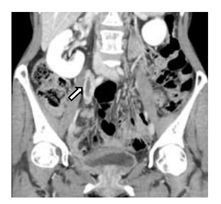
Figure 1: Abdominal contrast CT revealed thrombosis in the right ovarian vein (arrow)

Test results at hospital admission (Table 1) indicated nephrotic syndrome, with TP concentration of 4.9 g/dL, Alb of 2.4 g/dL, and 24-hour urinary protein level of 3.5 g/day.