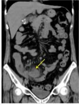
Figure 1. CT images. Abdominal CT revealed a swelling of the appendix and the presence of ascites around the appendix (arrow).

the effects of the tocilizumab into consideration. On the first day after the operation, the patient's WBC count was 10,400 cells/m³, and her CRP level was 0.55 mg/dl, and she began to take meals. On the third day after surgery, her WBC count had decreased to 8,100 cells/m³, her CRP level was 1.69 mg/dl and her temperature was below 37.0°C. On the fourth postoperative day, the drain was removed. On the fifth day, her WBC count had decreased to 6,700 cells/m³ and her CRP level was 1.33 mg/dl; antibiotics were stopped. However, on the seventh day, the patient's body temperature began to rise, and her RA symptoms steadily worsened. She was transferred to a hospital specializing in RA on the fourteenth day after surgery. The previous administration of tocilizumab did not appear to have affected the healing process.