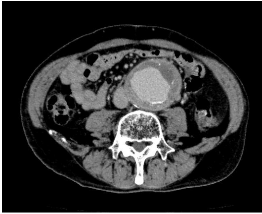
Figure 1. Abdominal aortic aneurysm observed by contrast-enhanced chest computed tomography (CT).