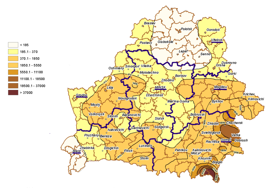
Fig 2. <sup>131</sup>I deposition density (kBq/m<sup>2</sup>) in the soil of Belarus as of May 10, 1986 [11]. Borders and administrative centers of oblasts are highlighted in violet.