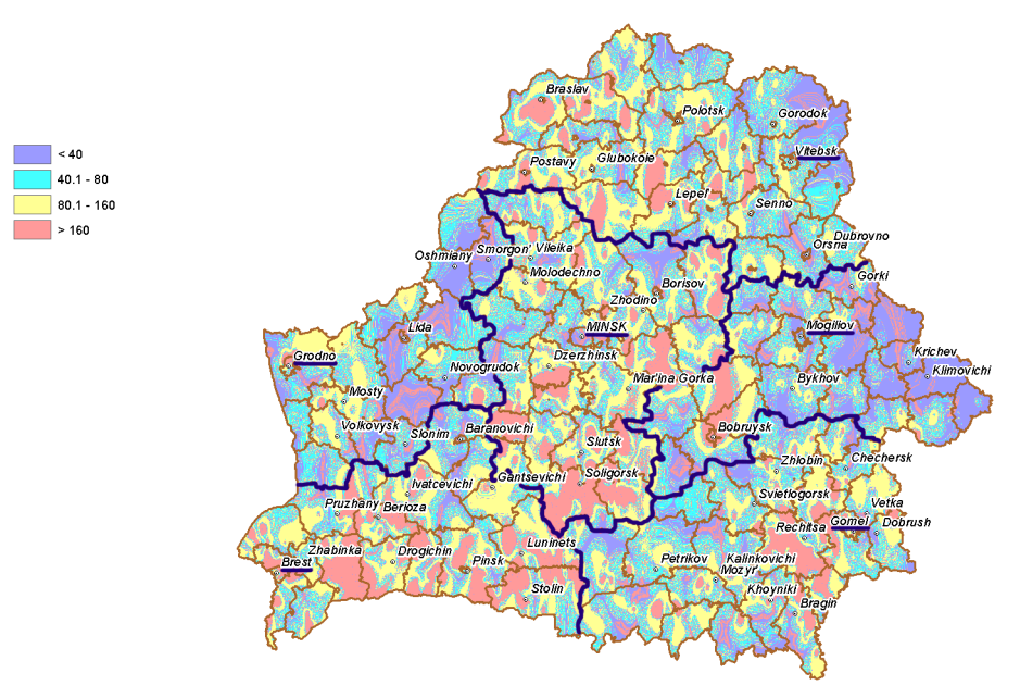
Fig 3. Nitrate concentration (mg/L) in groundwater from open wells in different areas of Belarus in 1988–1990. Borders and oblast administrative centers are highlighted in violet.