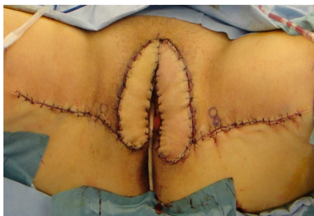
Figure 2 - The resurfacing of the vulvar wound using a gluteal-fold perforator flap.

comparison to the fasciocutaneous flaps, and vascularity is reliable. While elevating the fasciocutaneous flap, the long triangular incision is across the cutaneous branches of obturator and posterior thigh nerves consequently, which causes the prolonged sensory disturbance on the medial thigh and gluteal regions 1 . Besides, large fasciocutaneous flaps sometimes required scar revision for their contraction, and had a risk of developing seroma or hematoma after surgery 7 . On the other hands, dissection of perforator flaps was carried in a supra-fascial plane level, which is free from nervous disturbance. And small incision reduced intraoperative bleeding, although surgeon used usual scissors, not manage to prepare a computer-controlled bipolar diathermy system 7 .