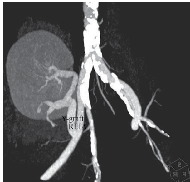
Figure 2. Severe atherosclerosis was noted from distal aorta to bilateral iliac arteries, except right external iliac artery. SPK composite was transplanted to right external iliac artery. REIA – right external iliac artery.

The induction therapy consisted of intraoperative basiliximab (20 mg) for induction and subsequent doses on Day 4.