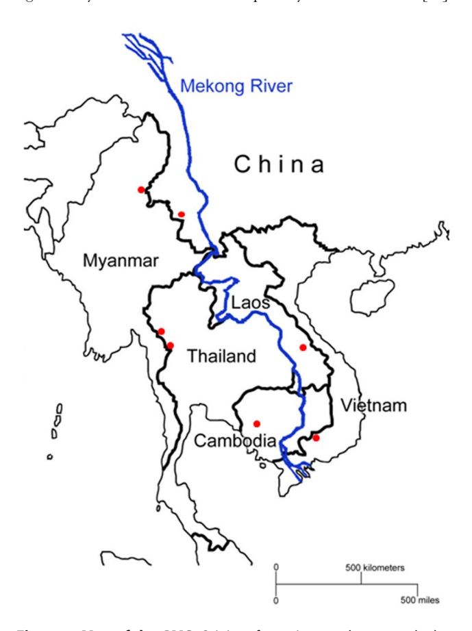
Figure 1. Map of the GMS. Origins of parasite samples are marked as red dots. The Mekong River is shown in blue. doi:10.1371/journal.pone.0059192.g001

The exact mode of antimalarial action of ART drugs is still under debate [14]. It has been proposed that ARTs target the sarcoplasmic/endoplasmic reticulum Ca<sup>2+</sup> ATPase (PfSERCA or PfATP6), since the heterologously expressed PfATP6 in Xenopus laevis oocytes can be inhibited by ARTs as well as thapsigargin, a sesquiterpene lactone that specifically inhibits mammalian SER-CAs [15]. Furthermore, replacement of leucine at codon 263 with glutamate, which is predicted to be located in the ART-binding site, causes abrogation of inhibition of PfATP6 [16]. However, introduction of the L263E mutation in P. falciparum through allelic exchange did not result in similarly dramatic changes in parasite's susceptibility to ARTs [17]. So far, mutations at position 263 have not been detected in field isolates from regions with suspected ART resistance. When comparing sensitivities to ARTs in field isolates from Cambodia, French Guiana, and Senegal, Jambou et al. found a S769N substitution in a limited number of parasite field isolates from French Guiana, which was associated with significantly reduced in vitro susceptibility to artemether [18].