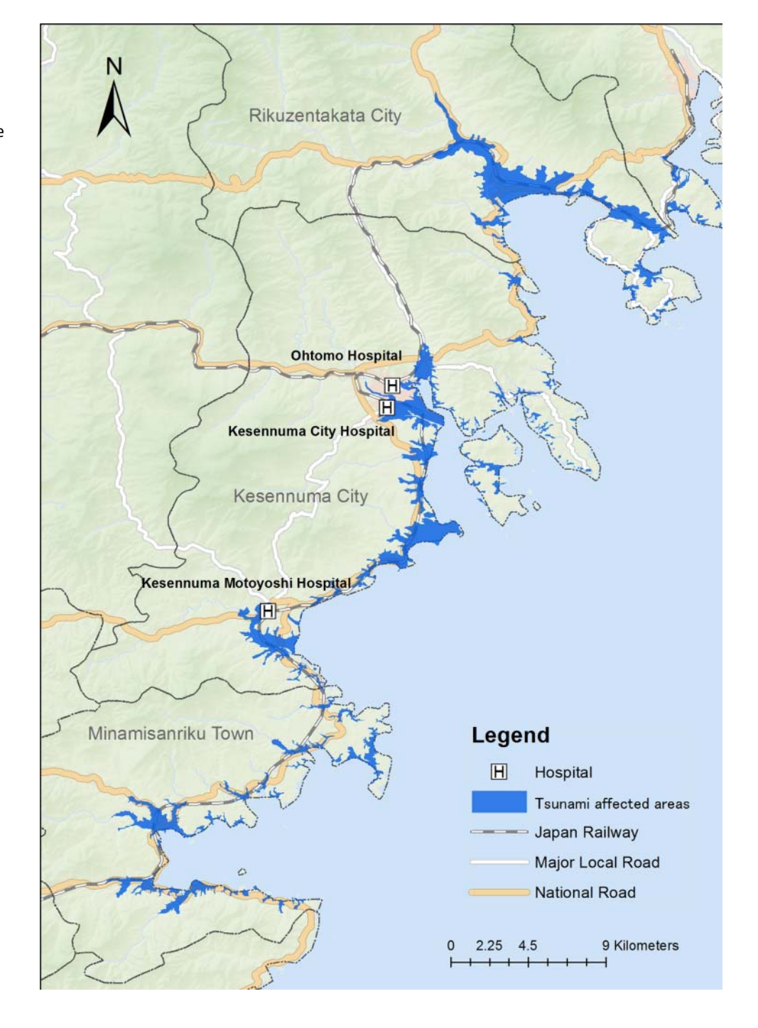
Figure 1 Area affected by the Tohoku earthquake and tsunami, Kesennuma City, Miyagi Prefecture. The disaster area data were obtained from the overview map of tsunami-affected areas released by the Geospatial Information Authority of Japan (http://www.gsi.go.jp/BOUSAI/h23_tohoku.html).

Kesennuma is located on the northeastern coast of Miyagi Prefecture (figure 1). The city has a long, saw-toothed coastline with narrow, flat land facing the Pacific Ocean. The total population in February 2011 was 74 257 (source: Department of