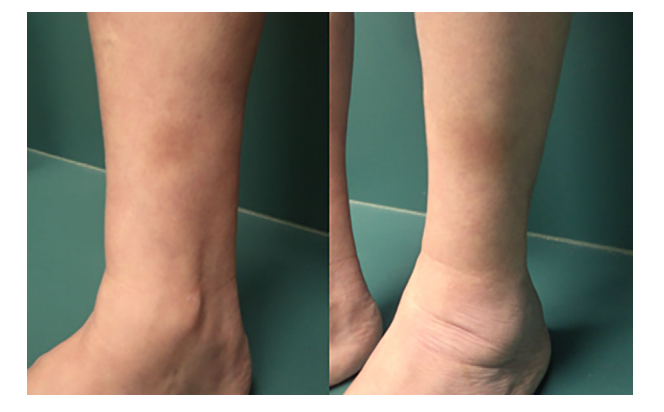
Figure 2. Erythema nodosum (EN)-like eruptions. Multiple thumb-sized erythemas with tenderness were observed on both legs at the second admission to our hospital.

A heart rate variability (HRV) analysis using 24-hour Holter monitor revealed a high-frequency (HF) value of