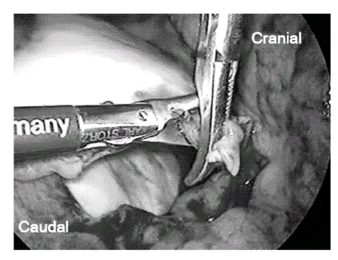
Figure 2. Case 1. The pericardium was cut using endoscopic scissors to avoid injuring the heart.

video-assisted thoracoscopic pericardial window was therefore used. With the patient under general anesthesia in a right decubitus position, one camera port and three access ports were created. Scissors were used to open the pericardium, rather than electrocautery, to avoid generating arrhythmia. While ensuring that vital signs remained stable, a 5\times5 -cm window in the pericardium was resected posterior to the phrenic nerve, taking great care to avoid injury (Fig. 2). A 19-Fr Blake drain<sup>®</sup> (Ethicon, Somerville, NJ, USA) was inserted into the thorax through a port site with no attempt to drain the pericardium. Intraoperative pleurodesis was not performed. On pathology, fibrosis and inflamma-